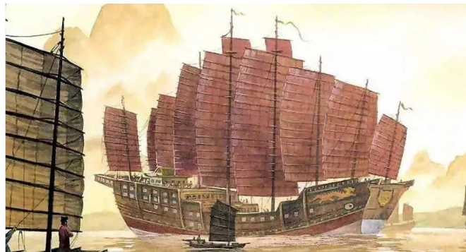
Figure 1. Maritime trade transport ships in the Beibu Gulf region during the Han Dynasty (Referring to the Han Dynasty Culture Museum in Hepu, China).

country is food for coupling, barbarian ships, transfer to it. Also for profit and trade, plagiarism and murder. And bitter meet the storm drowned, not a few years also. Big bead to surround 2 inches below... In the south of the Yellow River, there is no country, and the Chinese translation has since returned” [2] [3]. Mr.Feng Chengjun said: “The traffic between China and the South China Sea should be very ancient, but the book can only be traced back to the Book of Han · Geography Annals.” The earliest description of the Offshore Silk Road of the Beibu Gulf is in the Book of the Han Geography (See Figure 1 and Figure 2 ), although the geographical location of the countries is varied, we can see the general view of the coastal Silk Road of the Beibu Gulf of the Han Dynasty. Emperor, navigation technology and shipbuilding technology were not developed, the ships were only the coastline, and the Qin and Han dynasties’ ships were small, could not carry enough to maintain months of fresh water and food, in coastal areas must be intermittent docking, necessary supplies, to avoid or supplement the waves in the Beibu Gulf coast many natural harbor and city provides natural shelter for coastal navigation, the Beibu Gulf offshore Silk Road in the emperor generation initially formed.